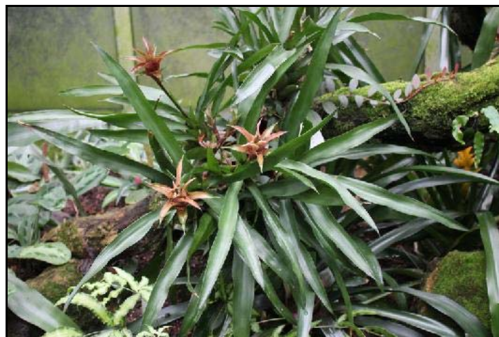
Canistropsis bilbergioides

Canistropsis has 11 species and are found in the Atlantic forest in southeastern Brazil. They enjoy shade and moisture. Previously, they were in the Nidularium genus. They take the same care as Vriesea and Guzmania .