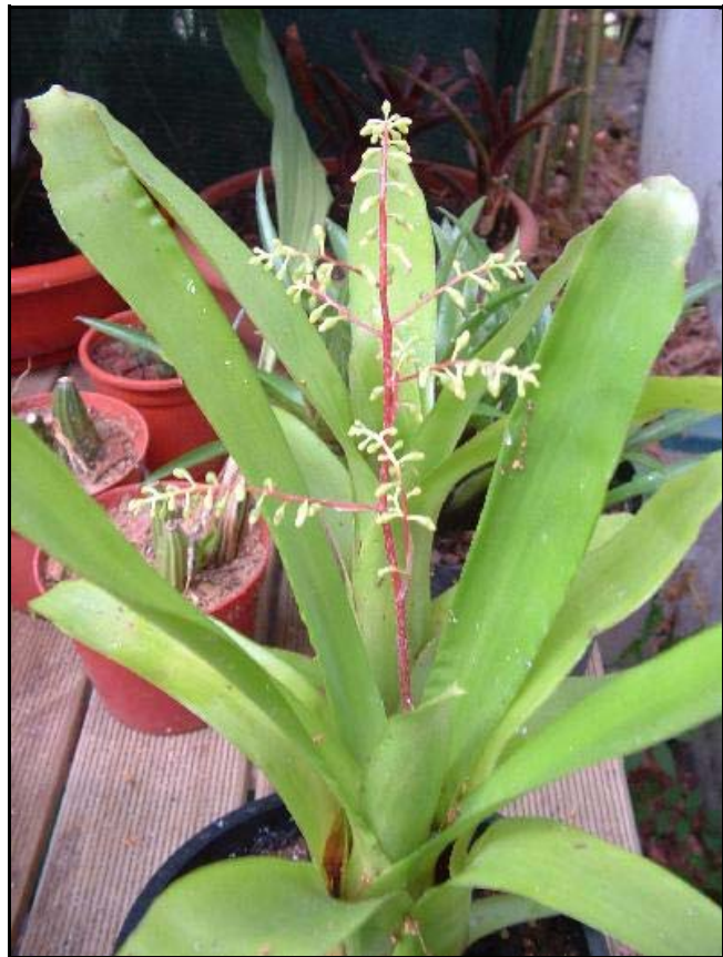
Araecoccus parviflorus

There are only two species of Androlepis , skinneri and fragrans . They are native to central america and southern Mexico.