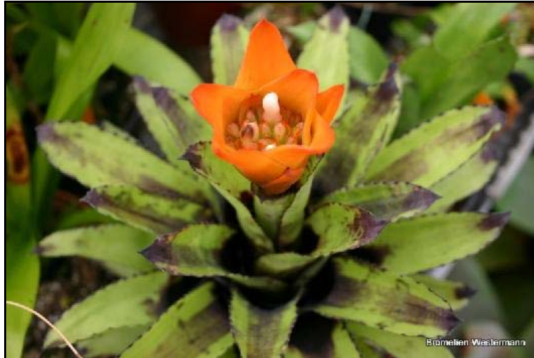
Canistrum triangulare

Canistrum are also found in the Atlantic forest in southeastern Brazil. There are 13 species. It was named for a basket carried on the head. They also like shade and moisture. It has a flat topped inflorescence which rises above the leaves.