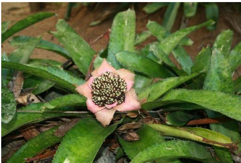
Edmundoa lindennii var rosea

Edmundoa was earlier grouped with Canistrum. There are three species and three cultivars.