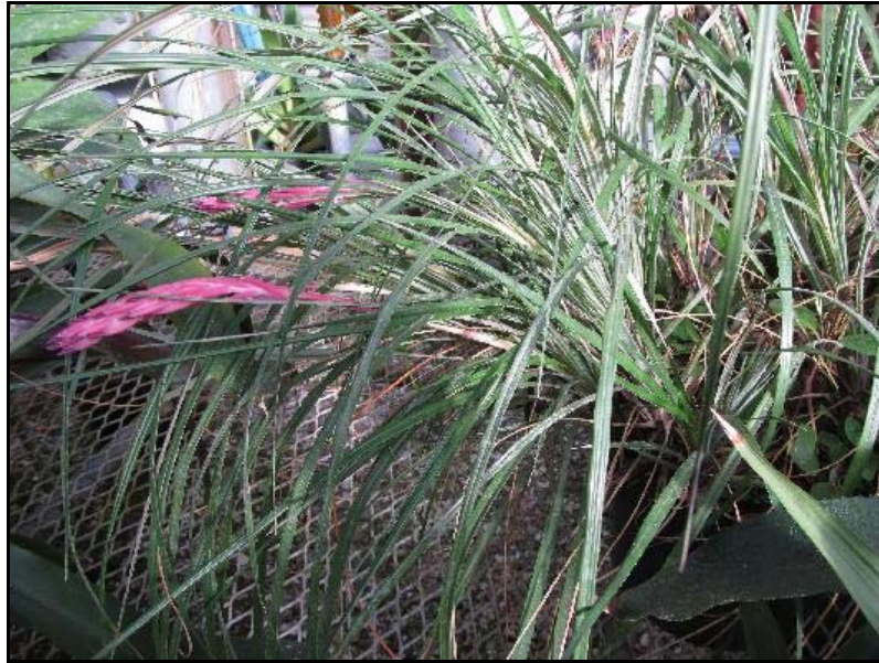
Fernsea bocainensis

Fernsea has two species both endemic to Brazil, bocainensis and itaitiaiae . They are small drought tolerant plants, narrow heavily spined leaves’.