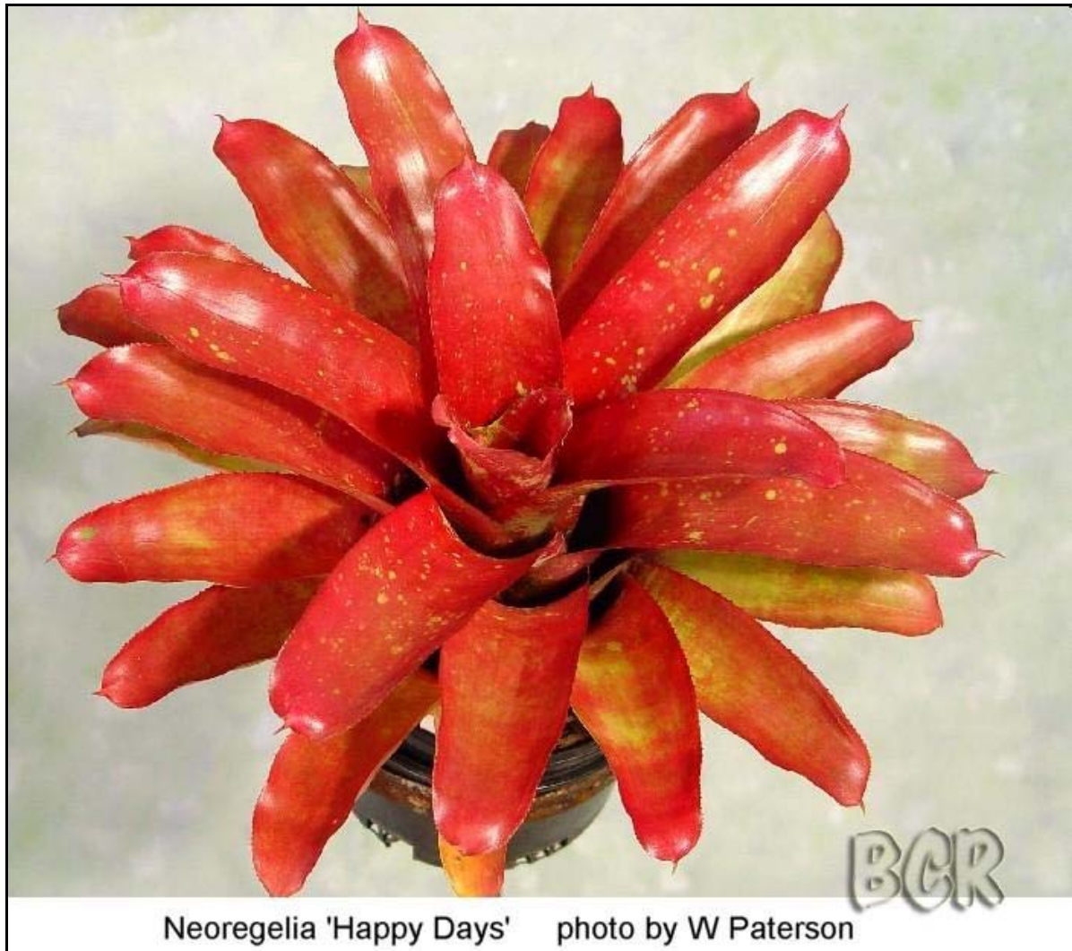
Neoregelia 'Happy Days'

We all hope next year will be a Happy New Year and we will have Happy Days again. (Hopefully have a meeting!)