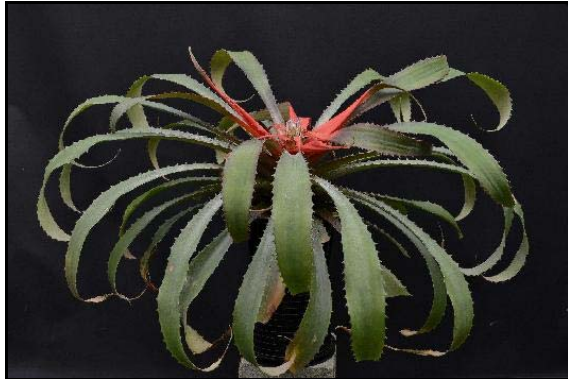
Both pictures are Bromelia agavifolia

Bromelia was named by Linnaeus in 1737. There are 70 species and two cultivars.