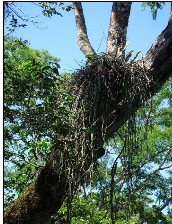
Acanthostachys strobilacea

The first is Acanthostachys which has two known species Acanthostachys pitcairnioides and Acanthostachys strobilacea . It has cascading spiny leaves.