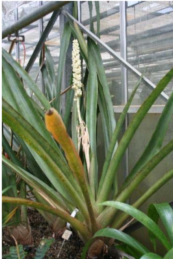
Androlepis skinneri

There are three species of Ananas and one variety as well as many cultivars. The pineapple is the most economically grown Bromeliad.