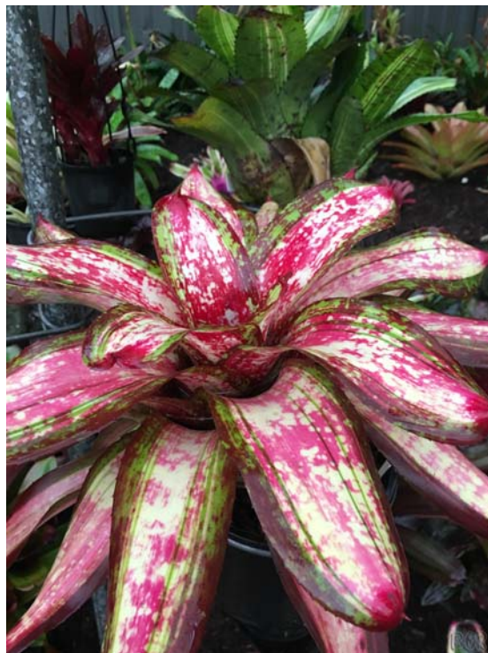
Neoregelia 'Christmas Lights' from registry.bsi.org